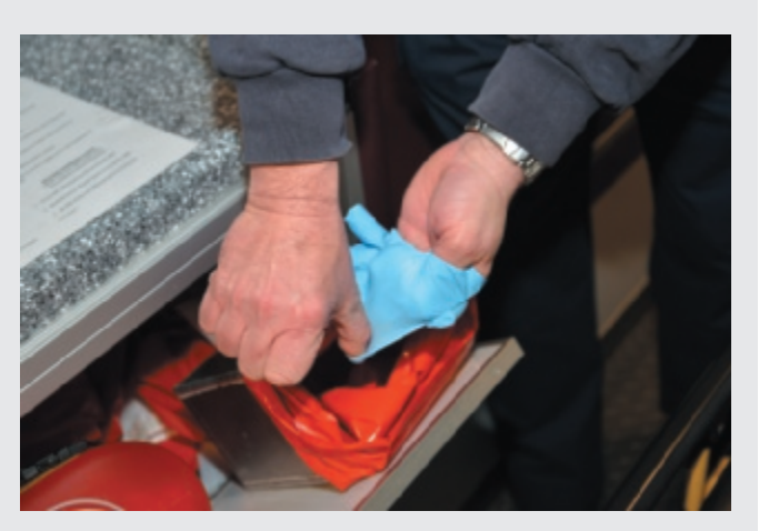
4. PUT UNGLOVED THUMB FROM HAND #1 INSIDE CUFF OF GLOVE #2 TO PULL GLOVE #2 OFF. Do not touch the contaminated outer surface of glove #2.