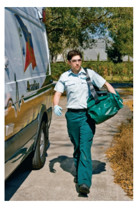
FIGURE 1-4 A professional appearance inspires confidence.