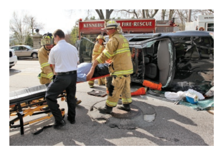
FIGURE 1-10 EMS must strive to embrace best practices of conducting and evaluating research to provide high-quality care for our patients.

For example, you might note that applying a bandage seems to control minor external bleeding. To use the scientific method, you might hypothesize that bandages do indeed control bleeding better than doing nothing at all. You could conduct a randomized control study to test your hypothesis by randomly assigning patients to the "bandage group" or to the "do-nothing group." You could then measure the amount of bleeding in each group and compare your results. Although there are some ethical issues with your study, this experiment would help you prove or disprove the value of bandaging. Furthermore, if your experiment were done properly, your results would hold up if the study were repeated, regardless of who conducted the experiment. That is the value of quality research.