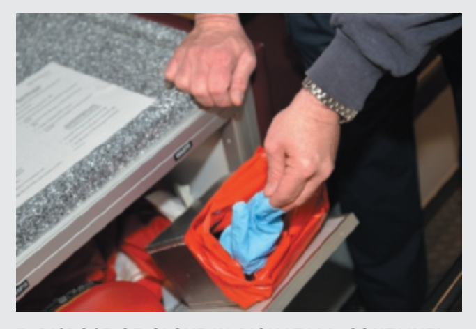
5. DISPOSE OF GLOVE IN BIOHAZARD CONTAINER.