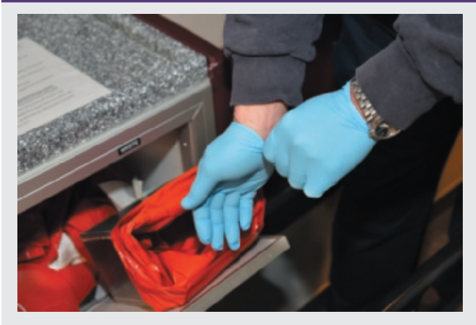
1. PULL AT TOP OF GLOVE #1.