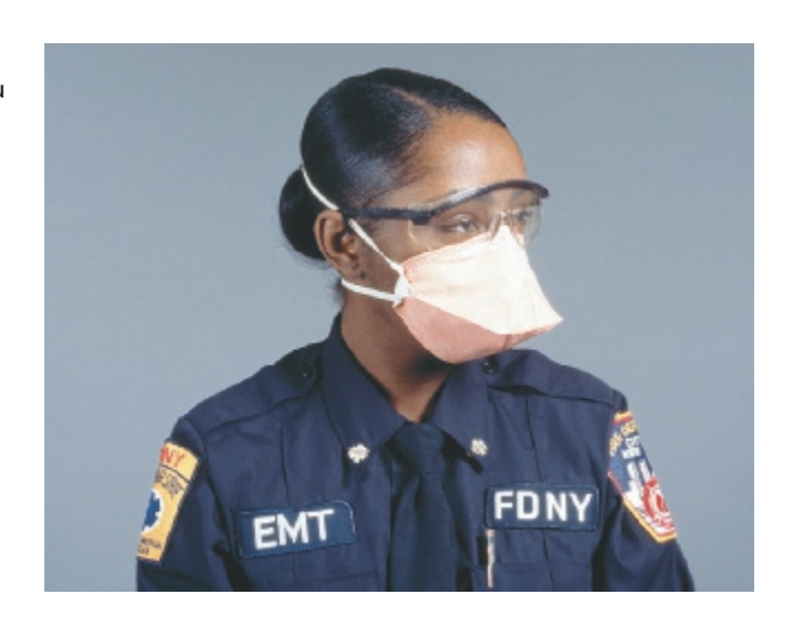
FIGURE 2-3 Wear a NIOSH-approved respirator when you suspect a patient may have tuberculosis.