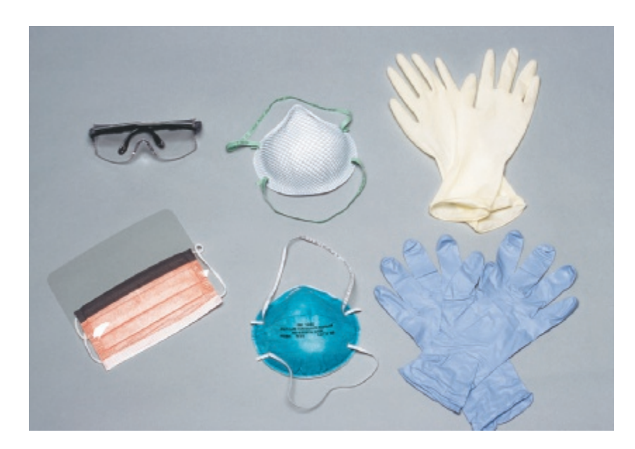
FIGURE 2-1 Always wear personal protective equipment to prevent exposure to contagious diseases.

CEVERYONE thinks to wear gloves. Remember to protect your eyes and face as well.