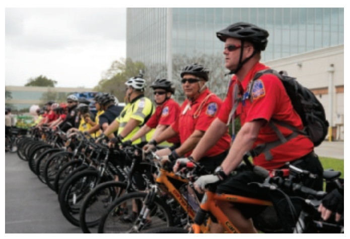
FIGURE 1-1 Some methods of delivering Emergency Medical Services: (A) By bicycle. (B) By mobile EMS unit.