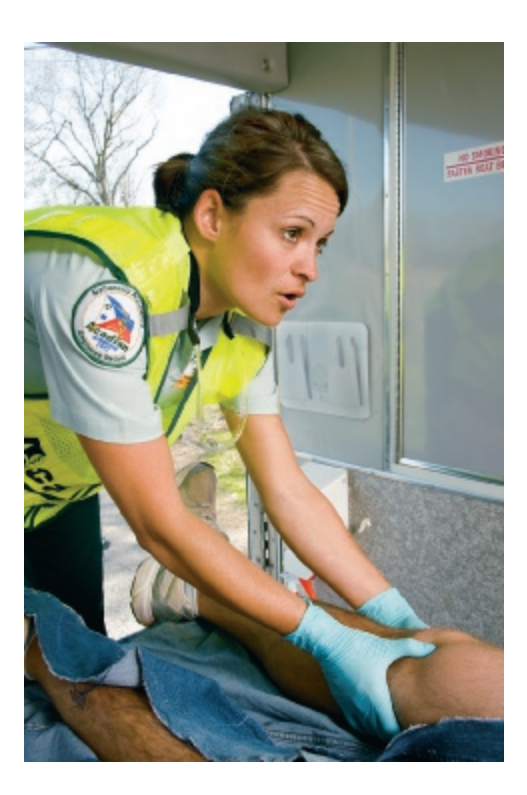
FIGURE 1-7 In many states an EMT candidate must have passed the NREMT exam to be licensed and certified by the state. This EMT practices in Louisiana, one state that requires NREMT registration.

Most states use the National Registry examinations as their certification exams. If your state or region does not use the registry exam, ask your instructor how you can sit for the examination. Upon passing the exam and obtaining registry, you will be entitled to wear the NREMT patch.