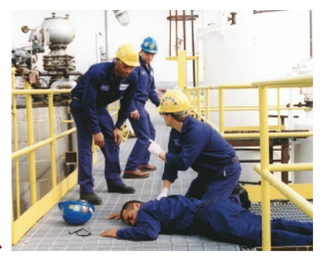
FIGURE 1-6 There are many career opportunities for EMTs, including work in (A) urban/industrial settings and (B) rural/wilderness settings.

The National Registry of Emergency Medical Technicians (NREMT), as part of its effort to establish and maintain national standards for EMTs, provides registration to EMRs, EMTs, AEMTs, and paramedics. Registration is obtained by successful completion of NREMT practical and computer-based knowledge examinations. Holding an NREMT registration may help in reciprocity (transferring to another state or region). It is usually considered favorably when you apply for employment, even in areas where NREMT registration is not required (Figure 1-7).