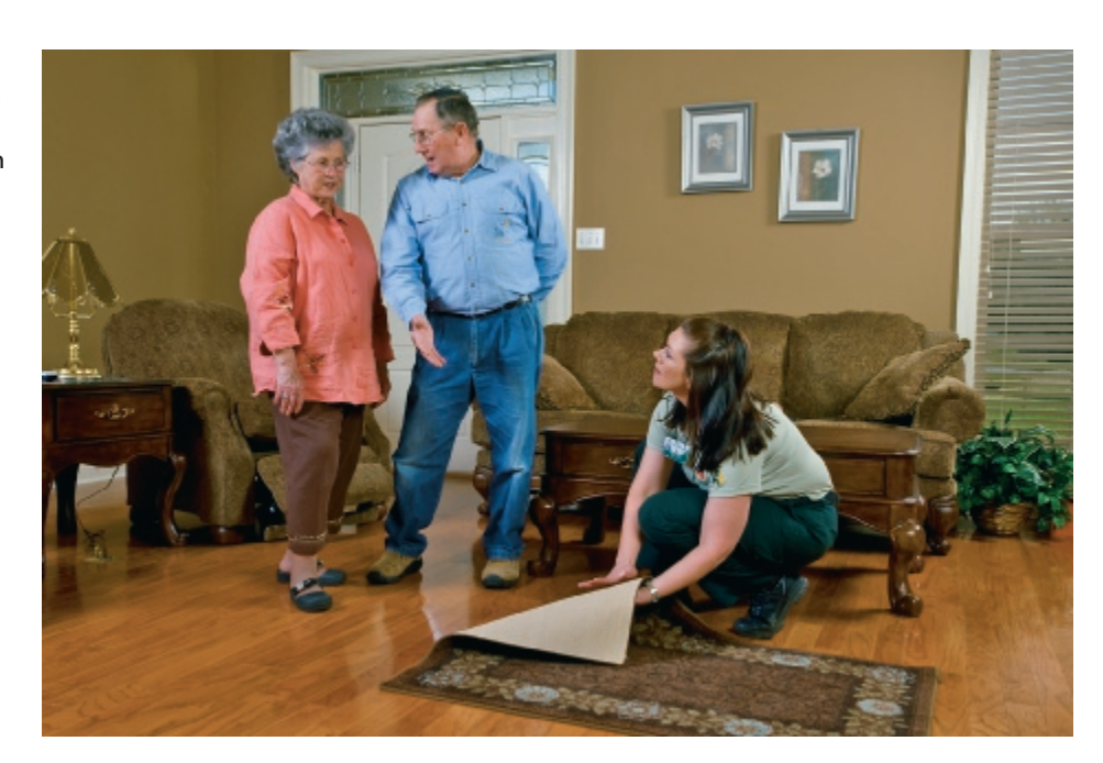
FIGURE 1-8 EMTs play important roles in public safety issues, such as providing fall-prevention advice to older patients.

Programs are being developed around the country that use EMS providers in different and innovative public health roles. These programs vary from location to location according to need but are collectively referred to as Mobile Integrated Health Care. Unlike hospital- or office-based medicine, EMS is always in the field, in patients' homes, and in the public eye. This visibility and access are vital to bringing health services