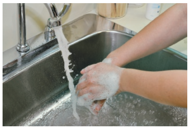
FIGURE 2-2 (A) Careful, methodical hand washing is effective in reducing exposure to contagious diseases. (B) Use a paper towel to turn off the faucet. (C) Alcohol-based hand cleaners are effective and often available when soap and water are not.

The mucous membranes surrounding the eyes are capable of absorbing fluids. Wear eye protection to prevent splashing, spattering, or spraying fluids from entering the body through these membranes. Protective eyewear should provide a guard from the front and the sides. Various types of eyewear are on the market. If you wear prescription eyeglasses, clip-on side protectors are available. Some companies offer protective eyewear that resembles eyeglasses.