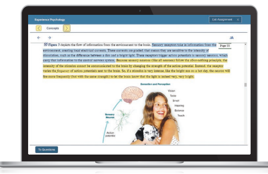
Laptop: Getty Images; Woman/dog: George Doyle/Getty Images